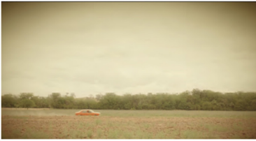
They say let go but I don't seem to know how.