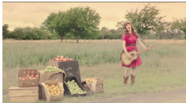
Get your hand off it.