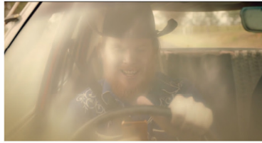
Cos I just need to...