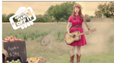
Get your hand off it.