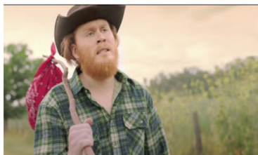
I've been walking down the road for several days now.