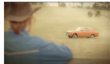
....that's gone away.