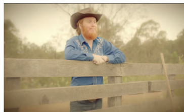
Thinking bout my love...